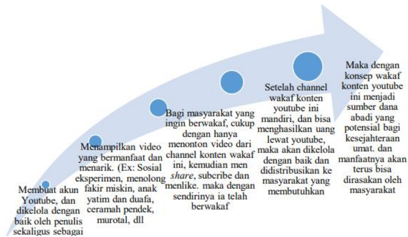
Figure 2. Scheme Supriadi et al. 1

endowment funds for the welfare of the people. (Supriadi et al:2020)